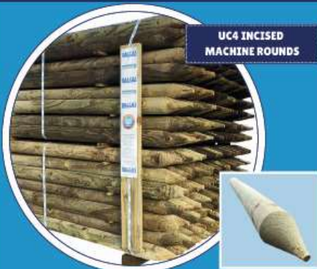
UC4 INCISED MACHINE ROUNDS