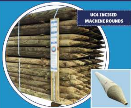
UC4 INCISED MACHINE ROUNDS