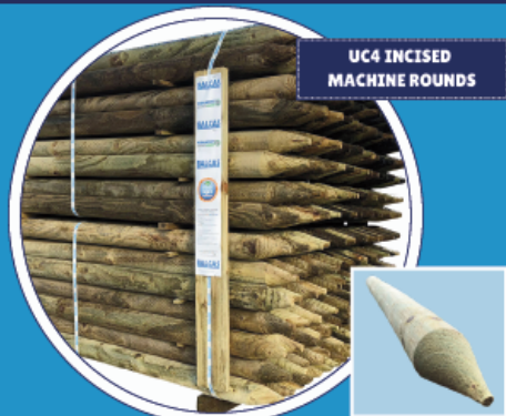
UC4 INCISED MACHINE ROUNDS