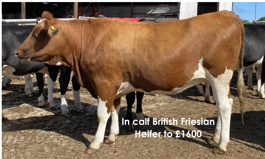
In calf British Friesian Heifer to £1600