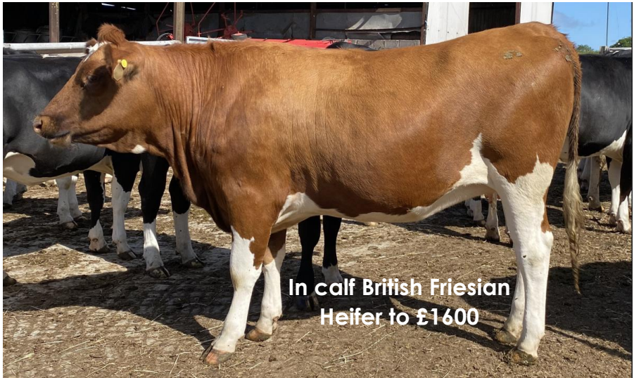
In calf British Friesian Heifer to £1600